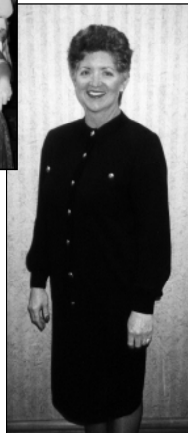
After Losing 70 Pounds!

“Losing 70 pounds... I am a new person!”